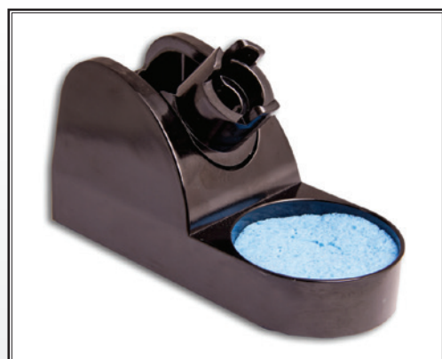
Safety Stand ST6A