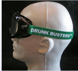
BAC of .04 to .06 Drunk Busters Low Level BAC Goggle (green strap)

Drunk Busters Goggles simulate effects of impairment, including reduced alertness, slowed reaction time, confusion, visual distortion, alteration of depth & distance perception, reduction of peripheral vision, poor judgment and decision making, double vision, and lack of muscular coordination. For some people, impairment might result after as little as one drink of alcohol, even though their Blood Alcohol Concentration (BAC) level would be quite low. Combining a small amount of alcohol with prescription medication can also lead to impairment, again with the possibility of a low BAC level. Use of illegal drugs is also impairing, with no BAC level even present.