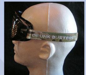
DRUG IMPAIRMENT GOGGLE Simulates many of the effects of using illegal drugs or overdosing on prescription medication, including disorientation, altered space perception, vertigo, lack of concentration, image distortion, memory problems, and feelings of euphoria. (camo strap)