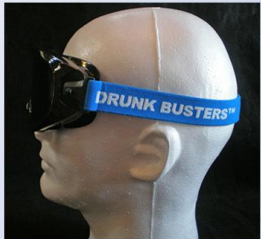
BAC of .06 to .08 Drunk Busters Low Level BAC Nighttime Goggle (blue strap)