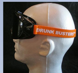
BAC of .26 to .35 Drunk Busters Totally Wasted Goggle (orange strap)