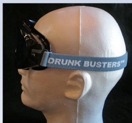
SNOOZE GOGGLE® Simulates fatigue in the early morning after working all night long and also extreme fatigue. (grey strap)