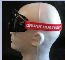
BAC of .15 to .25 Drunk Busters Twilight Vision Goggle* (red strap)