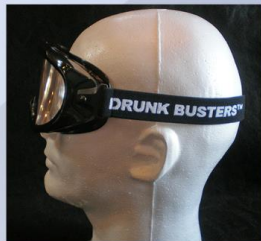
BAC of .08 to .15 Drunk Busters Impairment Goggle* (black strap)