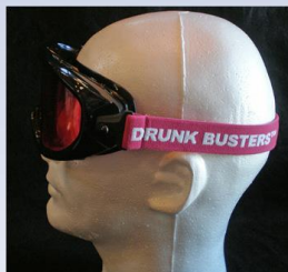
RED-EYE GOGGLE™ Simulates fatigue late in the day when the sun is about to go down and fatigue under low light conditions. (rose strap)