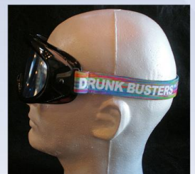
ECSTASY/MOLLY/LSD GOGGLE™ Distorts the perception of the size and shape of objects and also gives the user a distorted perception of color. (tie-dye strap)