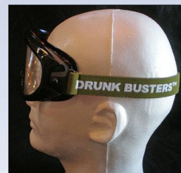
CANNABIS GOGGLE™ Impairs concentration and coordination, slows reaction time, results in a feeling of nausea, and can result in short-term memory loss. (olive strap)