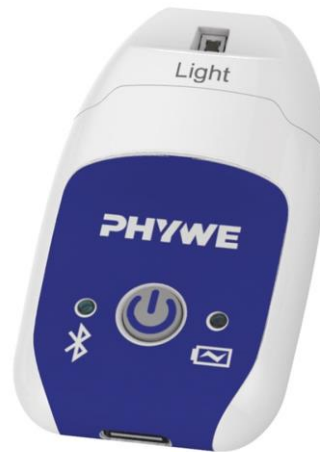
Fig. 1: 12906-01 Cobra SMARTsense Light 1... 128 kLx

The unit complies with the applicable EC-guidelines