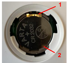
Press the battery into the socket by applying light pressure on the opposite side.

Slide the battery under the golden metal nose (Fig.6-1). Make sure that the battery is completely under the metal nose and is pushed completely to the upper edge.